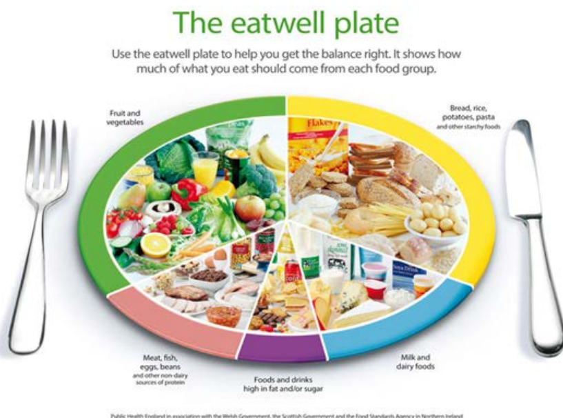
Figure 1. The Eatwell Plate

The ‘eatwell’ plate is applicable to anyone over the age of two years. Infants and toddlers need a higher proportion of fats in their diet. People who are over or underweight can use the ‘eatwell’ plate to help them eat the right foods, while increasing or decreasing their overall daily energy intake from food as needed. It can also be useful to suggest to people to eat a variety of colours of fresh food – as this leads to a wider intake of nutrients.