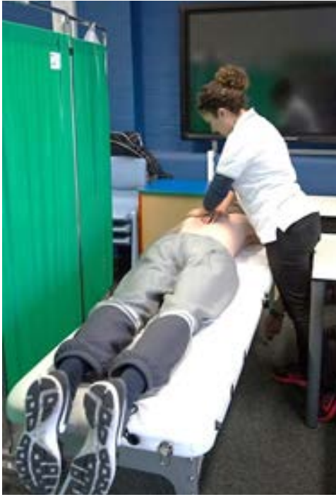
Physiotherapy at Crisis at Christmas

in centres. Another well-established service is Crisis at Christmas. Volunteer physios gave 218 physio sessions at Crisis at Christmas in 2016, suggesting there is a demand for physiotherapy which may currently be unmet by mainstream services.