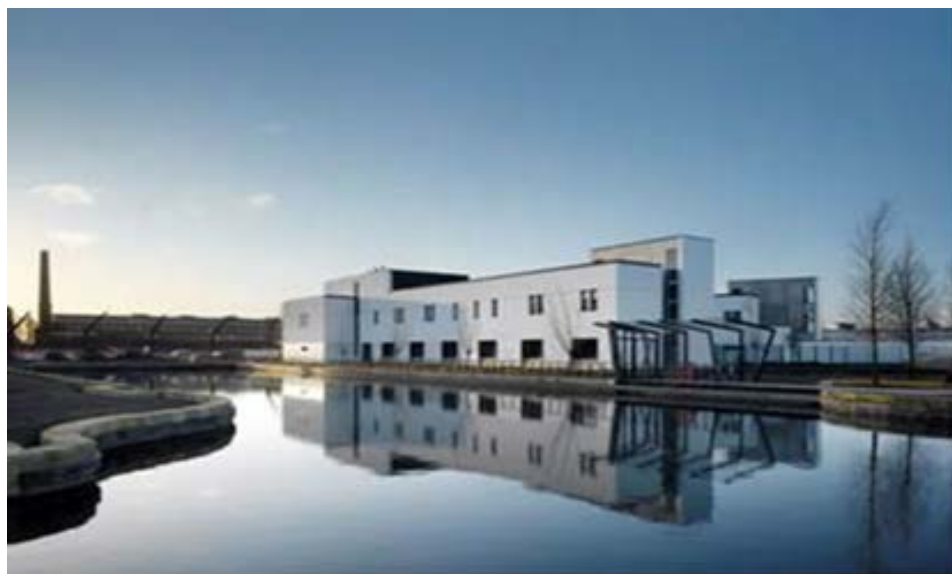
Urban Village Medical Practice in Manchester

UVMP are passionate about supporting homeless people to address their health needs, and helping them to access appropriate services. To promote this, they provide training to all people working with the homeless population in Manchester by delivering Homeless Healthcare Standards Training. They also deliver 'Know Your Rights' training to homeless people themselves, which provides information about their entitlement to healthcare, and advice on any issues which they may be encountering. They recently published a Homeless Health Needs Audit, based on research conducted with homeless people in Manchester in 2016. This provided an opportunity for homeless people to talk about their health issues and experiences accessing services, with the hope that the feedback could improve how services work to meet the needs of homeless people in the future.